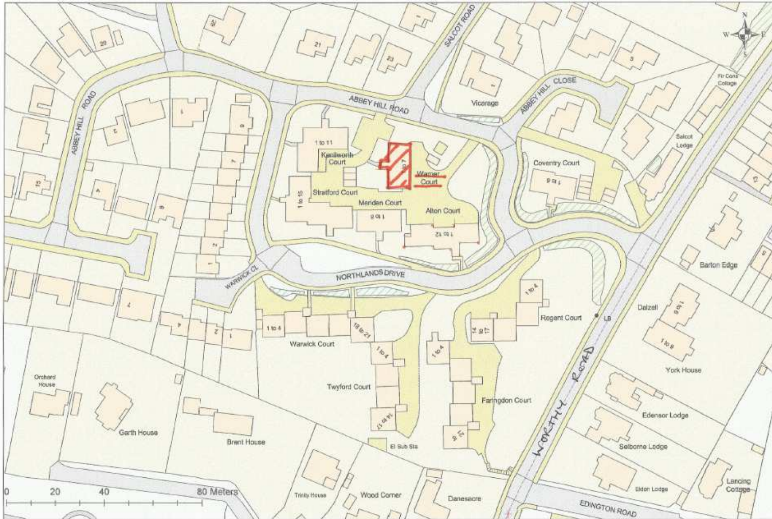
Northlands Drive 1:767.59

© Crown copyright and database rights 2013 Winchester City Council License 100019531